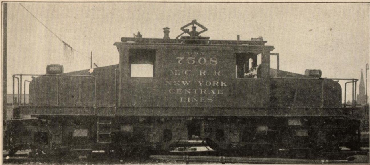
One of the electric locomotives used by the Michigan Central in the twin-tube tunnel which connects Detroit with Windsor, Ont., by speedy rail service under the Detroit River. These efficient locomotives are one of the important factors in the satisfactory all-season transportation provided by the Michigan Central at this point.